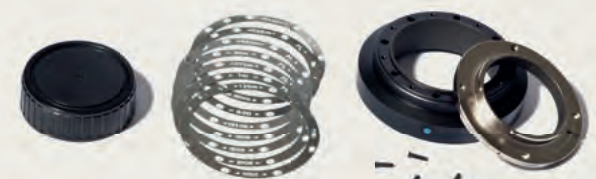
Mount kit Nikon F