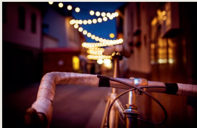
Xenon FF-Prime 35 mm

"I would describe the FF-Primes look as creamy and organic, very natural and classic."