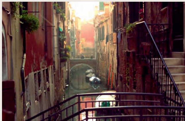
Xenon FF-Prime 50 mm

Schneider-Kreuznach offers a choice of transport solutions for the Xenon FF-Primes. Made of rock solid hard composite material, the Schneider-Kreuznach wheeled hard case features high-density foam cutouts for 4 lenses and rubberized textured handgrips to facilitate handling. Or users may prefer the individual pouches that each holds a single lens. Offering dense foam padded sides and floor, each durable fabric covered pouch zips up to secure contents within, and features a convenient carrying.