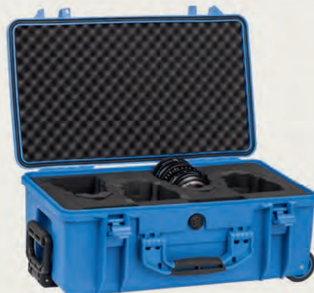
Wheeled hard case