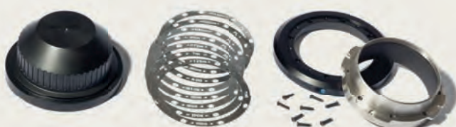
Mount kit PL