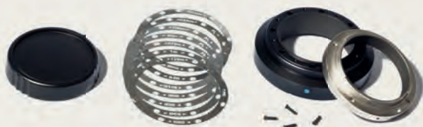
Mount kit Canon EF