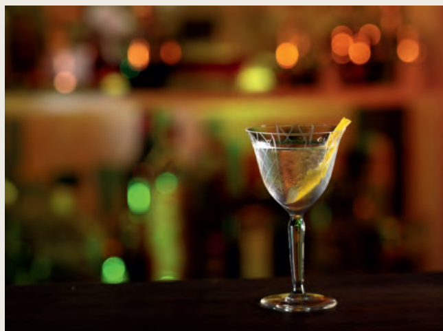
Xenon FF-Prime 100 mm

Engineering a lens from the ground up is a delicate balance of mechanics, glass and coatings. Schneider-Kreuznach's outstanding engineers have specified and selected the finest glass and applied propriety anti-reflection coatings to suppress unwanted flare. Most cinematographers agree that FF-Primes have a pleasing "film look" and the near telecentric design minimizes breathing while pulling focus.