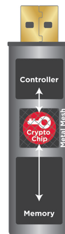
Figure 2. Drives that store encryption keys in a separate tamper-resistant cryptochip module are significantly more difficult to compromise. They tend to feature unique defenses, such as a metal mesh cladding and self-destruct function in case of physical attacks.