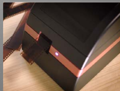
3. Starts automatically