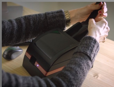
1. Load filmstrips

A hassle-free way to scan a large number filmstrips