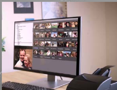
2. Open software Select scan mode