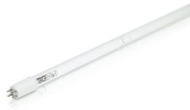
4 pins single ended