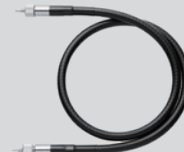
Flexible Cable CFC-12-990