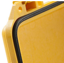
1123 Replacement O-ring