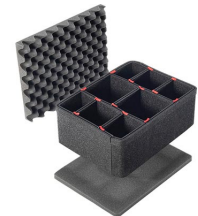
1120TPKIT TrekPak Case Divider Kit