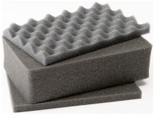
1121 3 pc. Replacement Foam Set