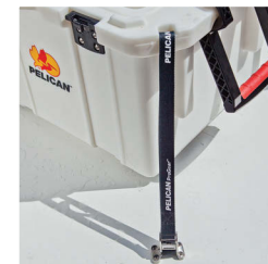
Tie Down Kit