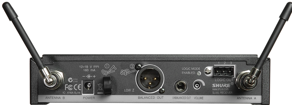
SLX4L Back Panel